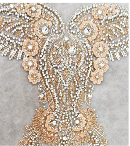
Rhinestones with peach beading, floral accents

Damsel White Label Miranda Shown mint with ivory lace