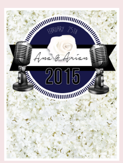
This bride and groom are singers, so we incorporated vintage microphones.