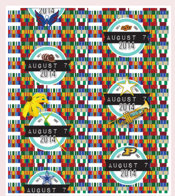
Army ribbons from the groom's father set the background while other symbolism special to the couple creates the foreground pattern.