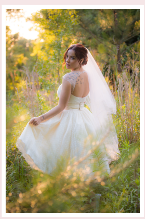
Tea length Shelby