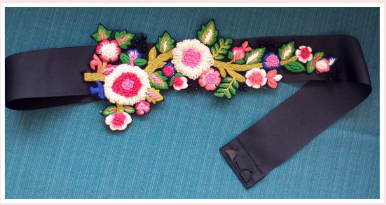
Hidden Garden belt, shown in vivids

What sets apart a bridal manufacturer from a tailor is embellishment. From rhinestone detail to threadwork, consider the infinite possibilties, all the places to hide special symbols and shapes.